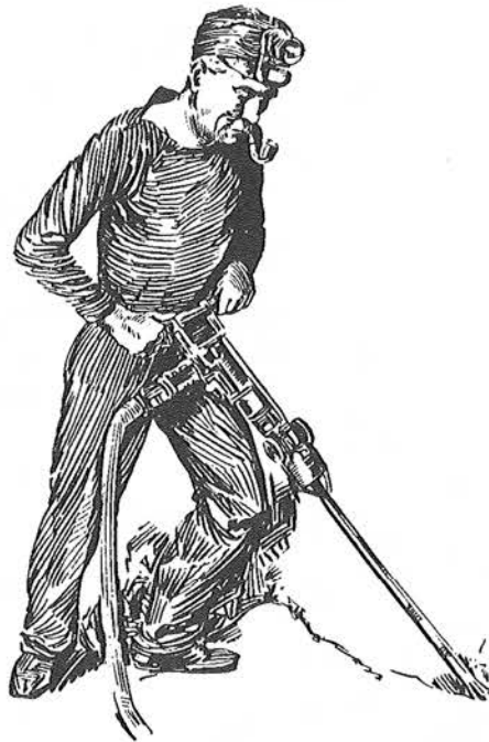
Colonial Steel Advertisement, Salt Lake Mining Review, 15 June 1922, p. 10.