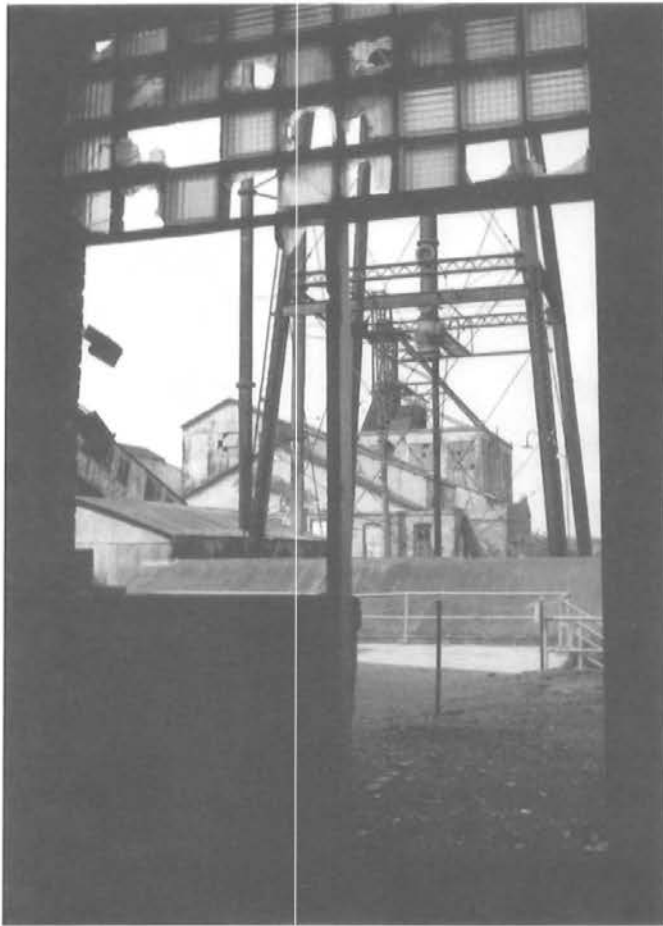
Two views of the remains of the St. Joseph Lead Company's Federal Mill No.3, Missouri Mines State Historic Site. St. Joe dominated mining and smelting in Missouri's Old Lead Belt for most of the twentieth century.